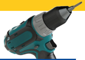
TABLE 1: DRIVER BITS; TENSILE, SHEAR, TORSIONAL STRENGTH *

DRIVER BITS MultiONE® screws include a complimentary TORX® compatible drive to optimise torque transfer from the drill driver to the screw. Always use the correct driver bit to suit the screw diameter (refer Table 1).